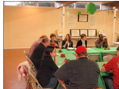
March Union Hill Neighborhood potluck.

Anyone interested in learning more about the Union Hill Neighborhood Association is encouraged to visit their facebook page at www.facebook.com/unionhillneighborhood . In addition, information on the role that Neighborworks America and AmeriCorps VISTAs play in revitalizing communities can be found at www.nw.org and www.americorps.gov .